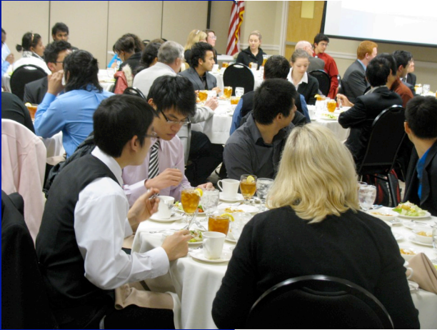
Tips for International Students Banquet