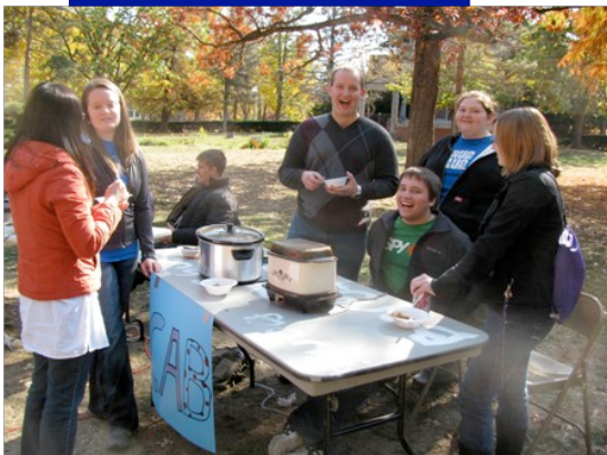
Chili Cook Off