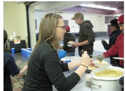
Last year's Habilidades Económicas

The first part of this project consists of a dinner and workshop teaching Latino adults basic financial literacy skills such as opening a savings account and safely using credit and debit cards. They also receive a work book outlining these topics for future use. We are currently trying to expand this project to other areas. The second part of this project consists of a one hour financial literacy program to help children learn the difference between a 'want' and a 'need', how to identify different coins, and how to save for the future. This will be done through two worksheets, several short activities, and the opportunity for participants to shop at 'The Store' which includes items of short term use (candy) and items of long term use (chalk).